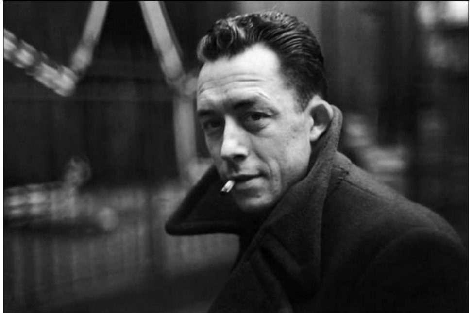
Albert Camus in 1958.

concepts as free will and the awareness of death, as well as the meaning of language and its ability to clarify an individual's search for purpose. We can see Ionesco's mockery of these ideas in Exit the King , both stylistically, in the rapid-fire dialogue interspersed with longer philosophizing, often nonsensical, speeches, followed by awkward silences; and thematically, in the ways that Ionesco ridicules the existentialist preoccupation with death