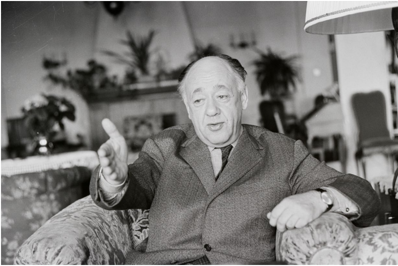
Ionesco at Dürrenmatt, Zurich and Beuchâtel.

Ionesco once told an interviewer that as a young man, he was never interested in anything besides literature. “Not drama. Literature.” He added that the first dramas to capture his imagination were the puppet shows he saw as a child, but that “nothing else” in theatre had ever interested him as much as those shows had. He also noted in the same interview that he always knew that he wanted to be a writer, and that he always preferred being alone (as much as he adored his wife and daughter). Perhaps Ionesco had to master the intricacies of language and of literature in solitude first, before he could write his complex, nuanced plays, which question the very ability of language to lead us to any revelations about truth, or even about life itself.