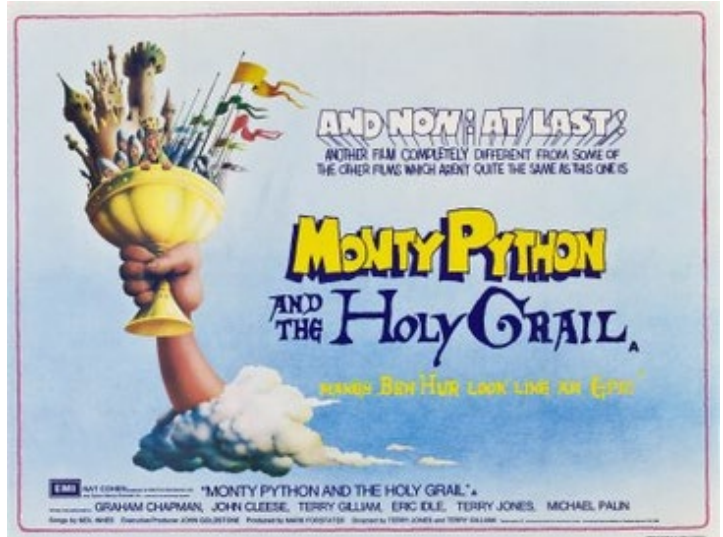
Monty Python. 1975 Poster.

its own merits; and even as we shake our heads over King Berenger and his willful, doomed resistance to dying, we can't help feeling sympathy, and maybe even a little admiration, for this man who clings so tenaciously to life. King Berenger's attempts to understand what is going on, and to make sense of his life's purpose, mirror our own struggles to do the same. In the end, Ionesco seems to say, we can do a lot worse than accept our lot with resignation and laugh at ourselves. After all, resistance to Death can be funny. In the Monty Python "Bring Out Your Dead" skit, one elderly man exclaims loudly, "I'm not dead yet!" when a younger relative attempts, a tad prematurely, to throw him on the plague-cart with the other dead bodies. Alternatively, we can choose to resist death with proud defiance; in George R.R. Martin's Game of Thrones , whenever a character is asked, "What do we say to the god of Death?" the response is simply, "Not today." But in Ionesco's Exit the King , where death is absolutely coming today (by the play's end, in fact), neither humor nor defiance can ultimately make any difference. And how we, as audience members, respond to the King's unavoidable fate (which is our fate too) is a choice that the playwright leaves entirely up to us.