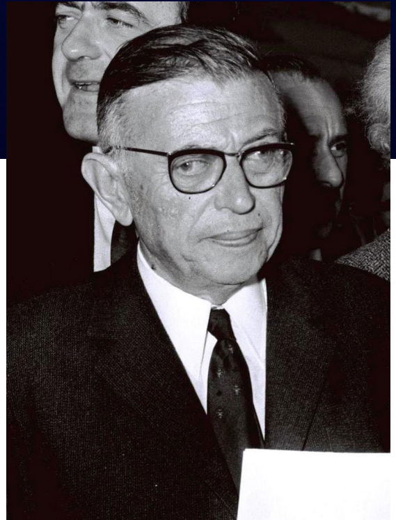
Jean-Paul Sartre in 1967. Creative Commons.

In the 1975 movie Monty Python and the Holy Grail , an early scene takes place in what appears to be a plague-stricken medieval town. Comedian Eric Idle, looking extremely bored, walks beside a cart laden with dead bodies, occasionally banging a piece of metal and yelling “Bring out your dead!” Although this very silly scene may seem to have little to connect it with significant works of dramatic literature, this now-iconic skit actually owes a great deal to a major theatrical movement that began in the middle of the 20th century and came to be known as Theatre of the Absurd. This highly influential development, which began in France with the work of playwrights Samuel Beckett, Jean Genet, and Eugène Ionesco, influenced far more than the Monty Python humorists; many playwrights, screenwriters, and other artists took inspiration from the Absurdist authors as well. Examples include the playwright Tom Stoppard, whose first hit was the zany yet witty play Rosencrantz and Guildenstern Are Dead (1966); some of Quentin Tarantino’s more over-the-top movies; The Cornetto Trilogy movies (including Hot Fuzz and the zombie caper “Sean of the Dead”); such wacky adaptations as Pride and Prejudice and Zombies (another zombie caper); and even the supremely silly Mystery Science Theater 3000 series.