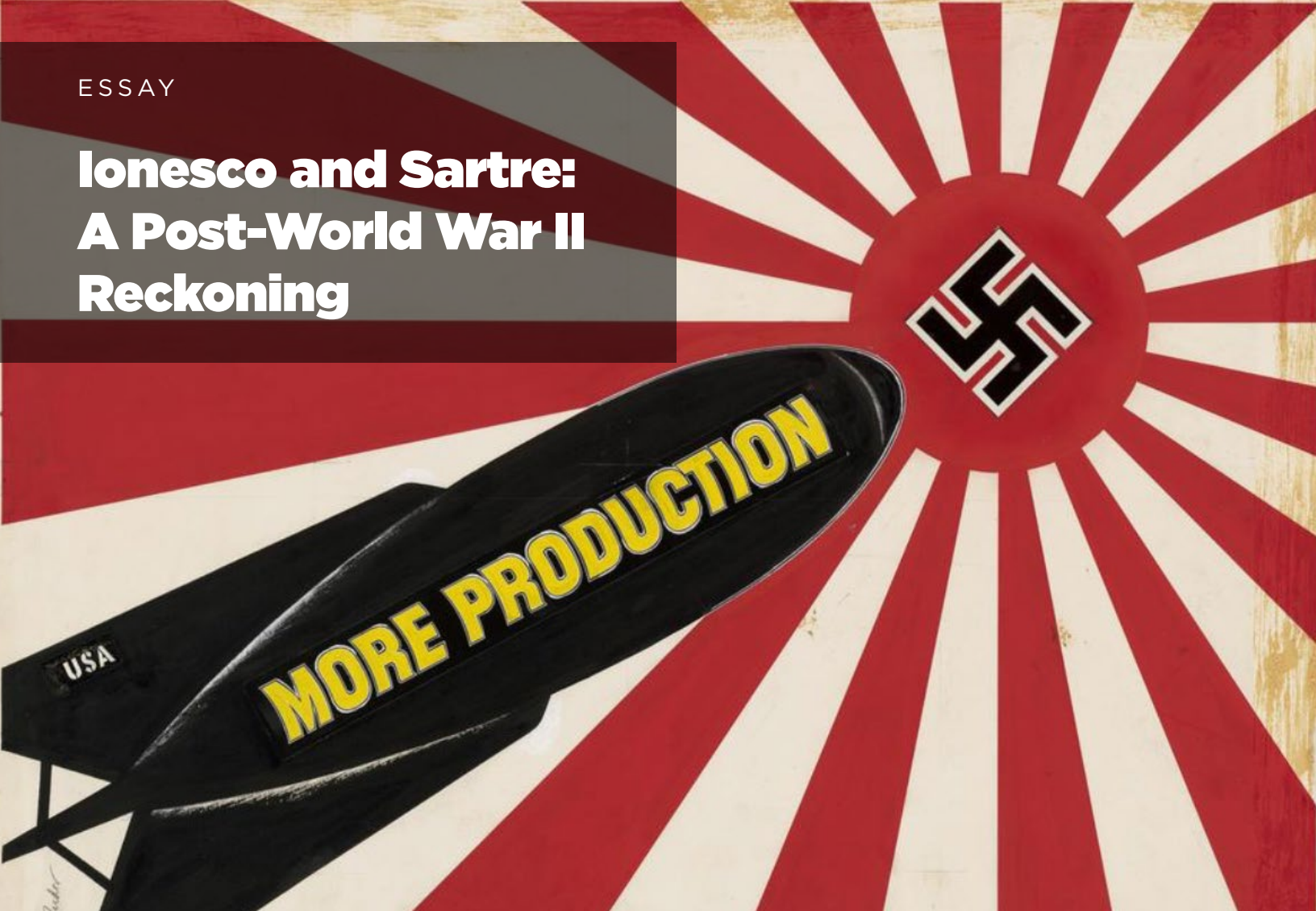
A propaganda poster created by the United States government between 1942 and 1945 inspiring Americans to work in resistance to Nazism. Creative Commons.

Playwright Eugène Ionesco disliked the term “Theatre of the Absurd,” although he is considered one of the foundational playwrights of that school. Instead, he preferred the term “Theatre of Derision” to describe his plays and those of certain other contemporary playwrights, many of whom he admired, such as Samuel Beckett (whose work he once described as “frank, simple, generous, and poetic”). But if Ionesco admired Beckett, he strongly disliked another contemporary and highly influential French playwright: the Existentialist philosopher, author, and public intellectual Jean-Paul Sartre. Although Theatre of Derision was probably a deliberate, and deliberately absurd, oversimplification by Ionesco of his works, to the extent that he was deriding anyone in his plays, he was pretty clearly deriding the Existentialists in general and Sartre in particular.