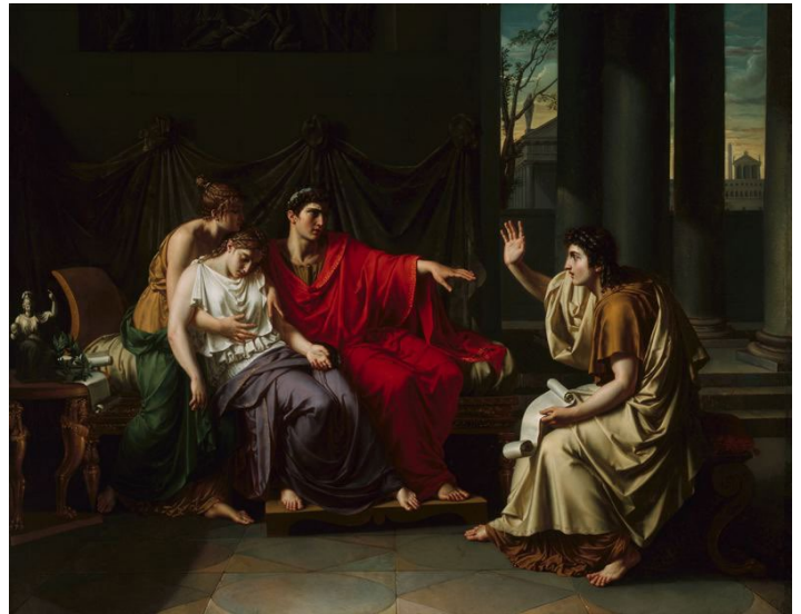
Virgil Reading the "Aeneid" to Augustus, Octavia, and Livia by Jean-Baptiste Wicar c.790/93

Like the tales detailed in The Epic of Gilgamesh , The Iliad , and The Odyssey , the stories that comprise Ovid's Metamorphoses have their roots in an oral storytelling tradition. However, unlike those works, Metamorphoses deviates from the some of the common conventions of epic poetry. Like most epics, Metamorphoses begins with an