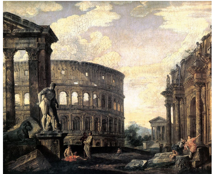
Ruínas de Roma Antiga by Giovanni Paolo Panini, c. 1725

followed. The Acropolis was built, a democratic system of government was established, philosophical thinkers—such as Plato—began work, and playwrights—such as Sophocles—began to write. This age lasted from about 480 B.C.E. to 330 B.C.E. Alexander the Great rose to power in the late Classical Period and began his quest to expand the civilization. He conquered Persia, invaded Egypt, and made territorial gains in Asia Minor. This was the start of the Hellenistic Age. As Alexander continued to expand his territory, he also spread Grecian and Hellenistic values to new territories. The Hellenistic Age continued until Romans began to take hold of Greek lands. By 31 B.C.E., Greece was part of the Roman Empire.