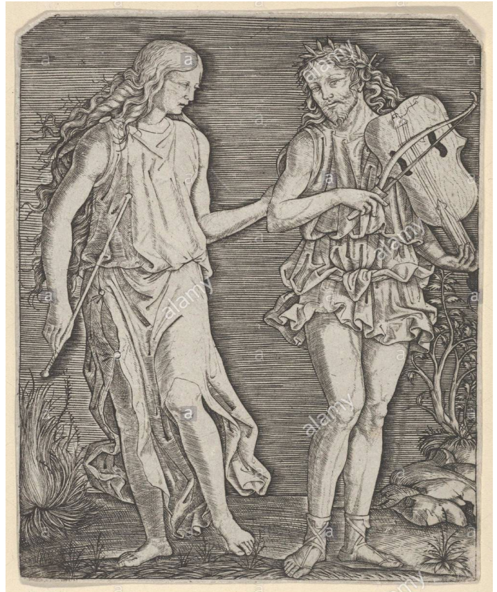
Orpheus and Eurydice by Marcantonio Raimondi, c. 1500-1506

In the case of Metamorphoses , each of the episodes is united by a common theme: transformation.