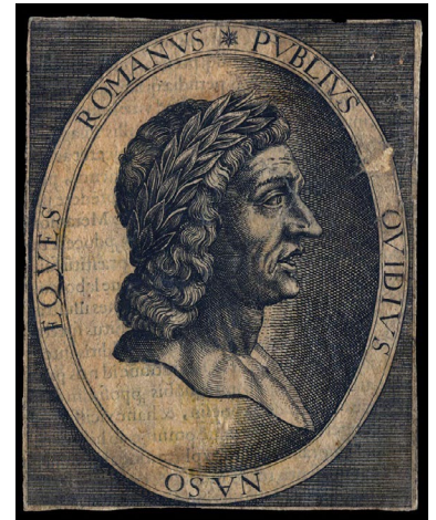
Ovid, copper engraving c. 1600

Ovid's work has remained in the public mind because of the unique perspective he offered on life at the time. In his work Heroides , he created a series of letters from Greek heroines to their missing partners, sometimes chastising them and sometimes wishing they would return home. This work gave a voice and perspective to a group often overlooked and ignored in mythology. In Metamorphoses , he demystified both well-known and commonplace myths. His perspectives on classical myths allow scholars to form a better idea of Roman literature at the time following the new Roman Empire, as well as the new rule of Emperor Augustus. ♦