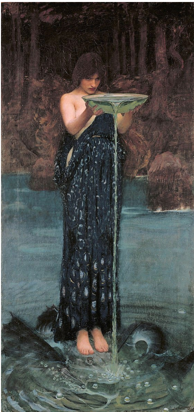
Circe Invidiosa by John William Waterhouse, c. 1892

Scientists look for several things when determining whether an environment has the capacity to support and sustain life. Of the different necessary qualifications, water is the most important. No known life form can survive without it. Life is made from water. Cities are built around water sources, such as Cairo around the Nile, London around the Thames, and New York around the Hudson. Water provides a source of power, an opportunity to trade, and the promise of a sustained source of life. However, along with the promise