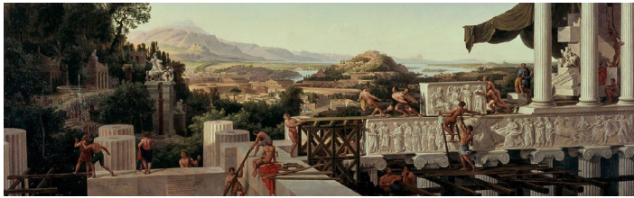
Blick in Griechenlands Blüte by Wilhelm Ahlborn, based on Schinkel's original, c.1836

While Ovid was a Roman poet who lived and worked during the Roman Empire, he drew from Ancient Greek myths to create Metamorphoses . Because of the influence of Greek stories on Ovid's work, it is important to consider Ancient Greek society as well as Ancient Roman society when examining Metamorphoses .