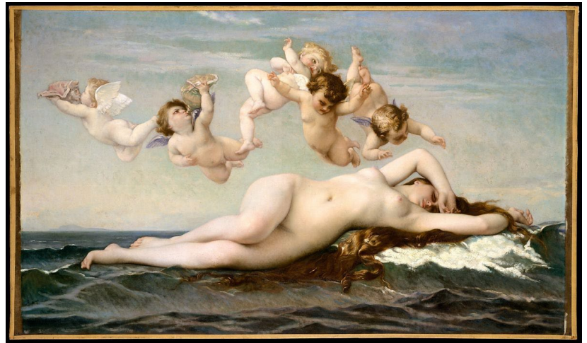
The Birth of Venus by Alexandre Cabanel c. 1863

In 1955, the poet and scholar Robert Graves wrote: “Myth has two main functions. The first is to answer the sort of awkward questions that children ask, such as ‘Who made the world? How will it end? Who was the first man? Where do souls go after death?’... The second function of myth is to justify an existing social system and account for traditional rites and customs.” Mythical gods and monsters played a significant role in both functions. The gods often create or manipulate the social structures of the