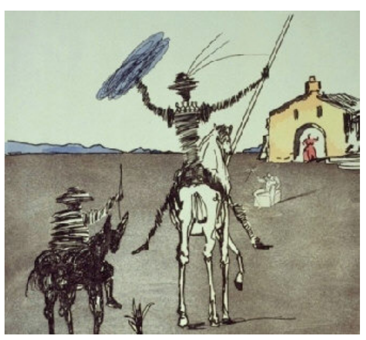
Don Quixote by Salvador Dali.

Man of La Mancha was born out of the experimental theatre movement of 1960s New York, and was written to be played in a small theatre. Its original New York production was staged in three-quarter thrust, with the audience on three sides of the stage. Just as Cervantes' novel rarely provides much detail of the settings of Quixote's adventures, leaving it up to the reader's imagination, likewise the musical's creators wanted their show to be extremely minimalist, with a bare set, minimal costumes and props, and the challenge to its audience to participate in the storytelling through the use of their own imagination. But it asks for us to participate in another way as well. In its heart, Man of La Mancha is about the 1960s, and by extension, about any time of political unrest-including today-and it is about the responsibility of each of us to make the world a better