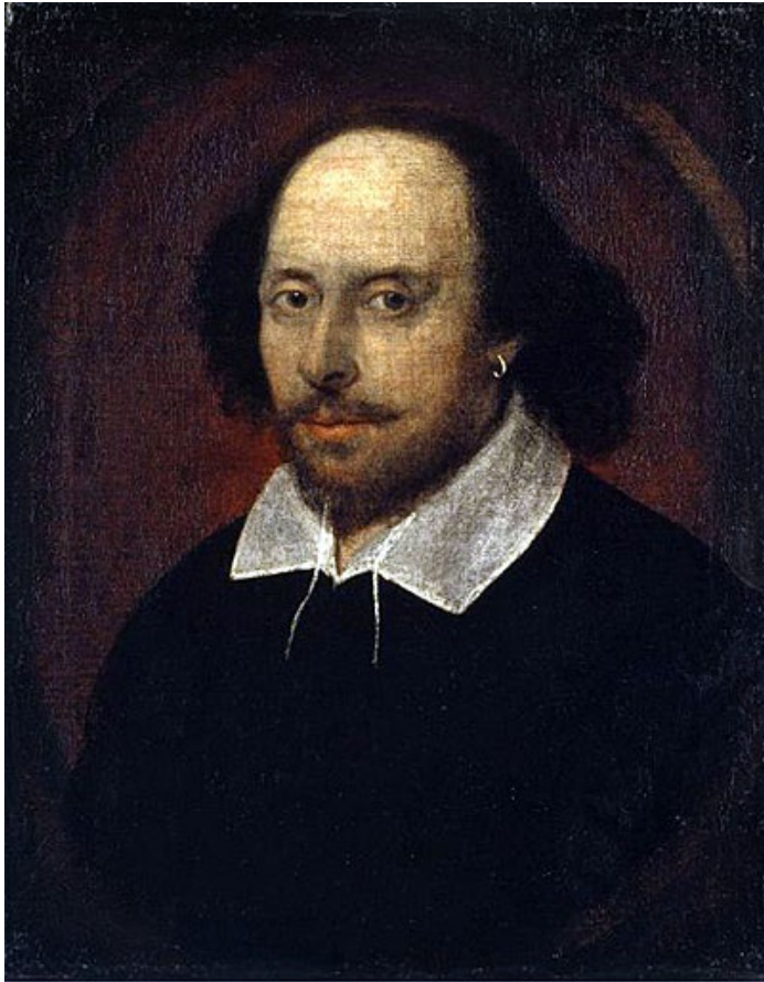
The Chandos Portrait of William Shakespeare. Artist unknown.

WILLIAM SHAKESPEARE (1564-1616), poet, playwright and actor, was born to Mary Arden and John Shakespeare in Stratford-Upon-Avon, England on April 23, 1564.