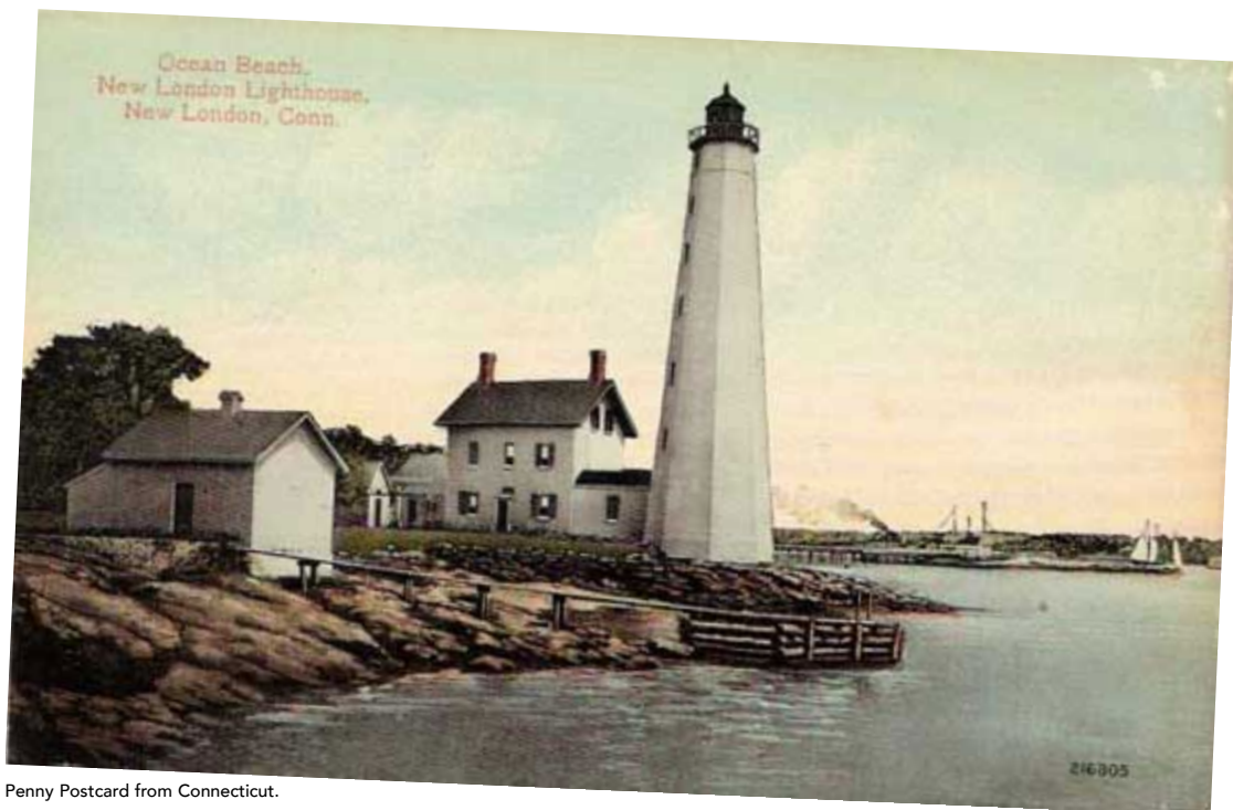
Penny Postcard from Connecticut.

colloquialisms in it, I think, that aren't general American small town. ... I happened to have my old home town of New London in mind when I wrote—couldn't help it—but New London, even in those days was pretty well divorced from its N.E. heritage—was lower Conn., in fact, with New York the strongest influence.