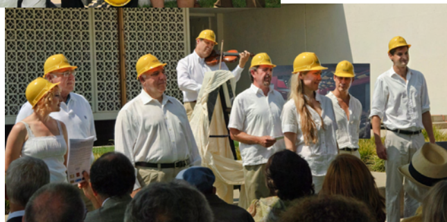
ANW Resident Artists